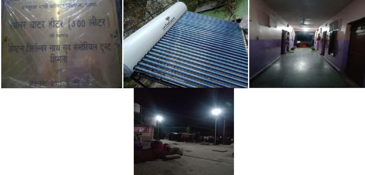
Five Solar lights have been installed in the hostel premises.